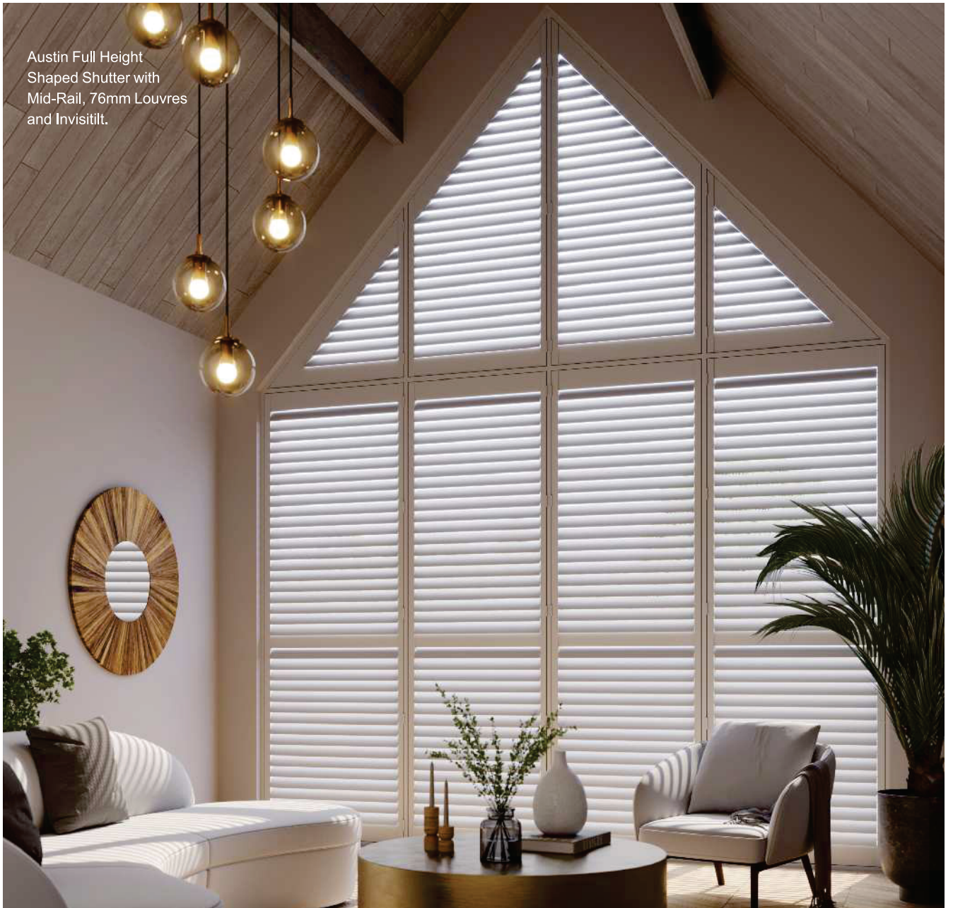
Austin Full Height Shaped Shutter with Mid-Rail, 76mm Louvres and Invisitilt.

Whether large or small, traditional or modern, square bay or curved bay, rectangular, square or shaped, all windows are catered for within our comprehensive portfolio of shutter products. Any shape is available in our Austin and Newport hardwood shutter range.