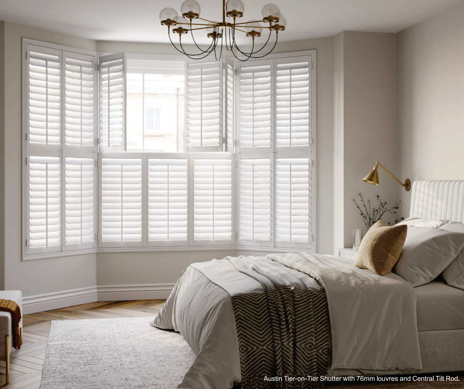
Austin Tier-on-Tier Shutter with 76mm louvres and Central Tilt Rod.