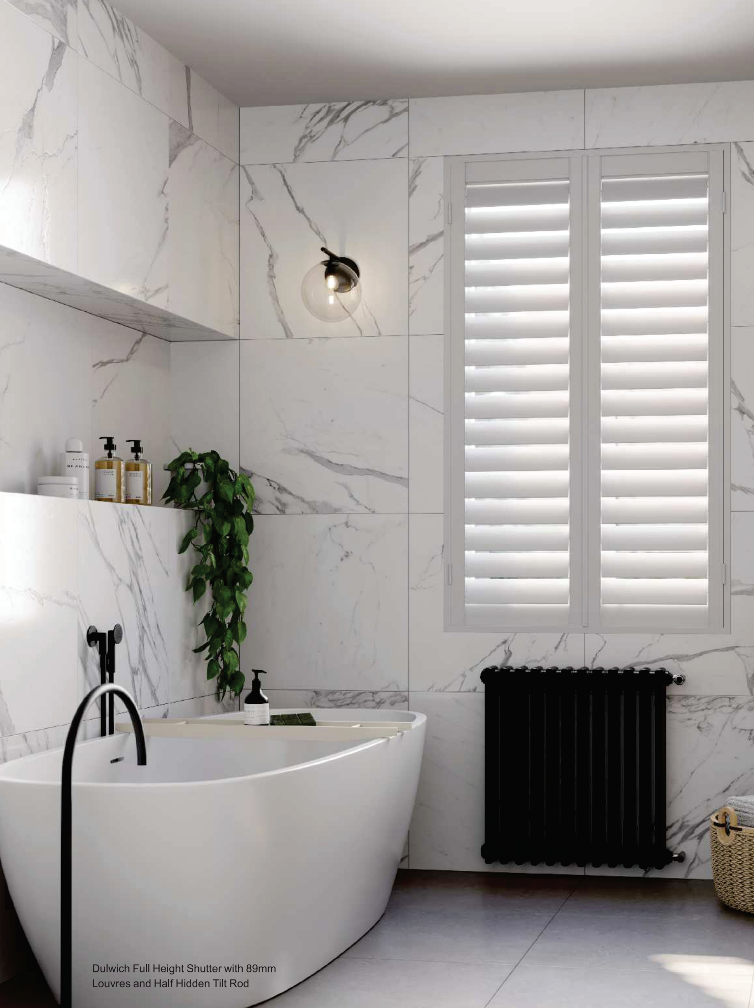
Dulwich Full Height Shutter with 89mm Louvres and Half Hidden Tilt Rod