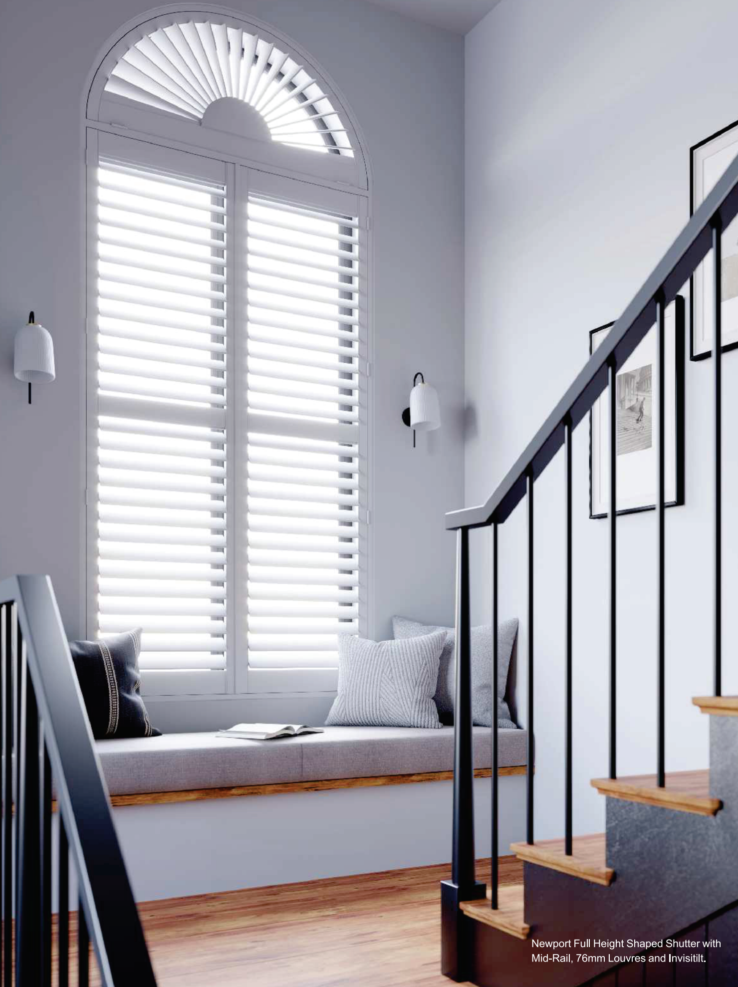
Newport Full Height Shaped Shutter with Mid-Rail, 76mm Louvres and Invisitilt.