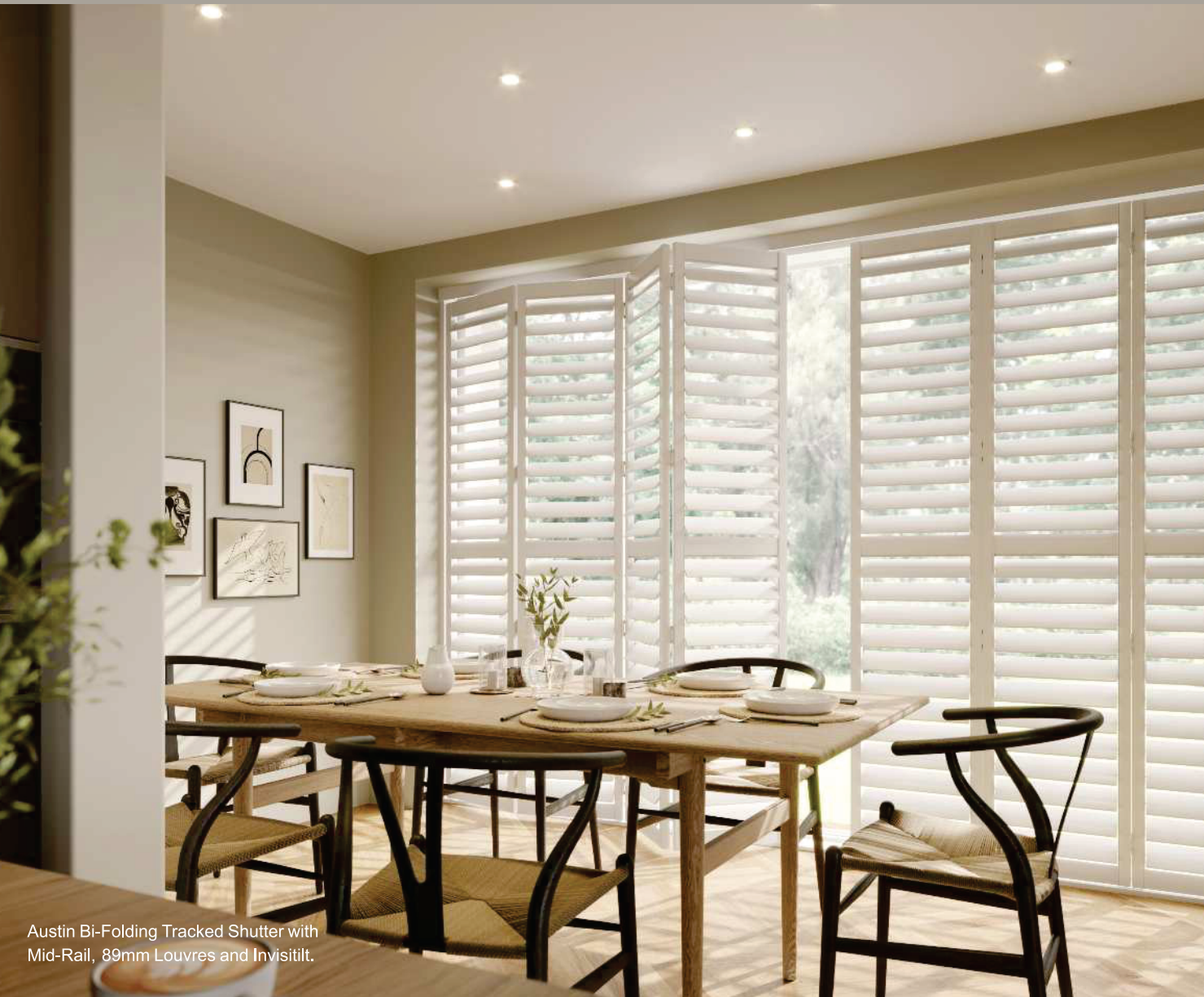
Austin Bi-Folding Tracked Shutter with Mid-Rail, 89mm Louvres and Invisitilt.

Tracked shutters can also be used as a stylish and versatile room divider.