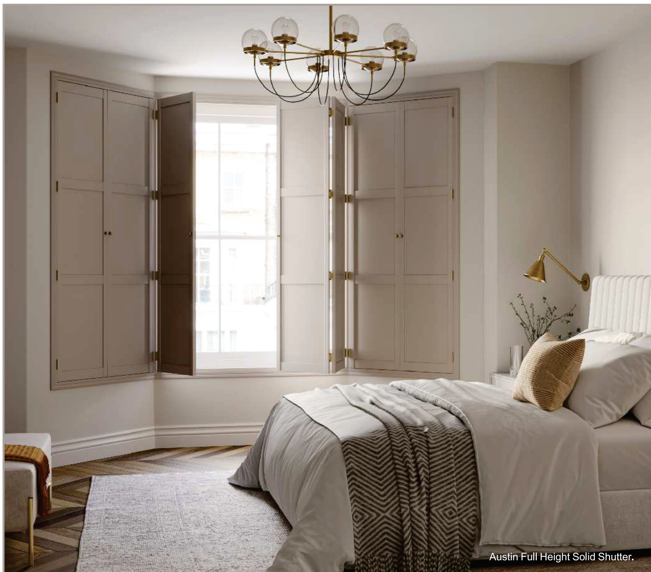
Austin Full Height Solid Shutter.