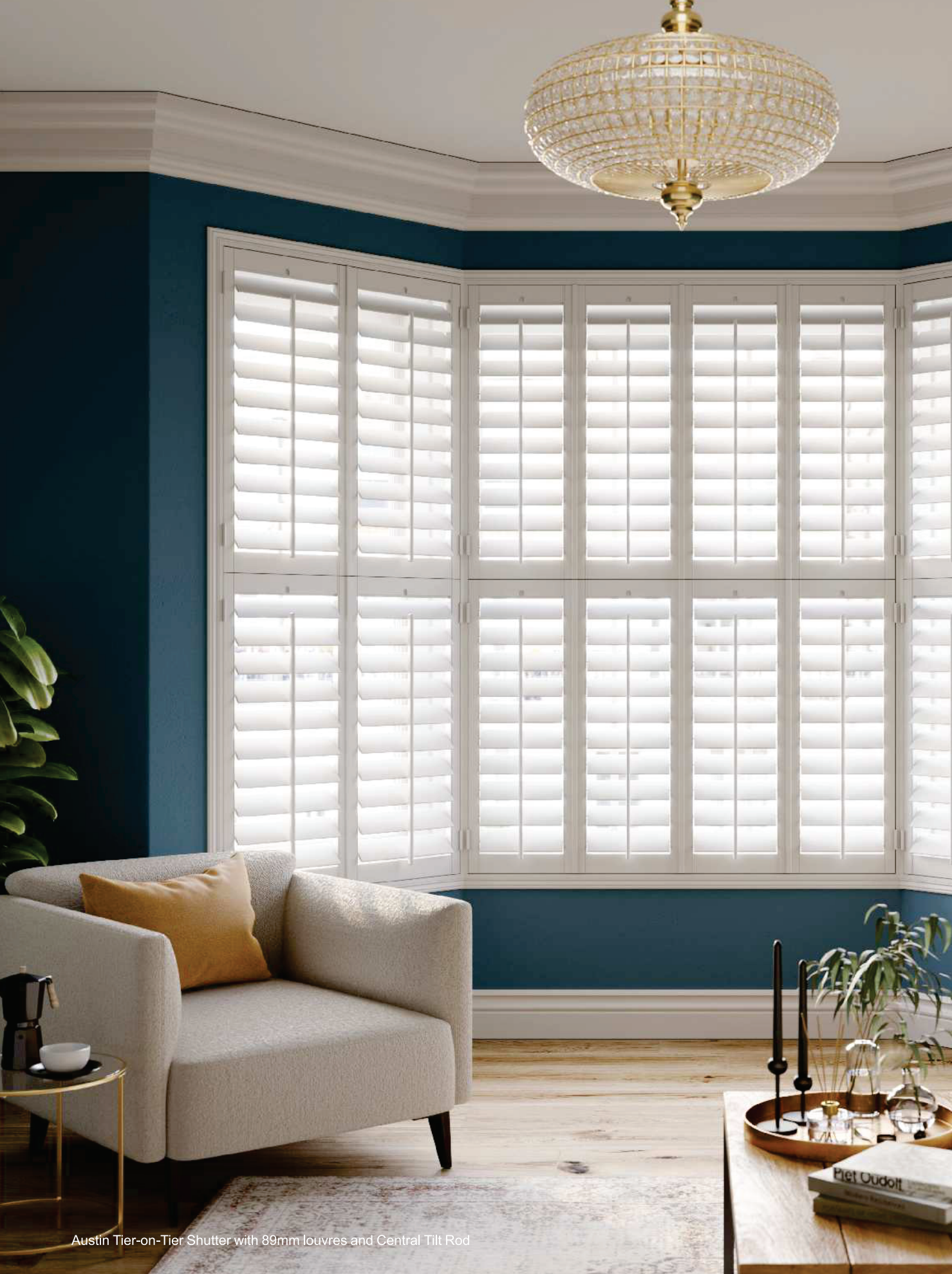
Austin Tier-on-Tier Shutter with 89mm louvres and Central Tilt Rod