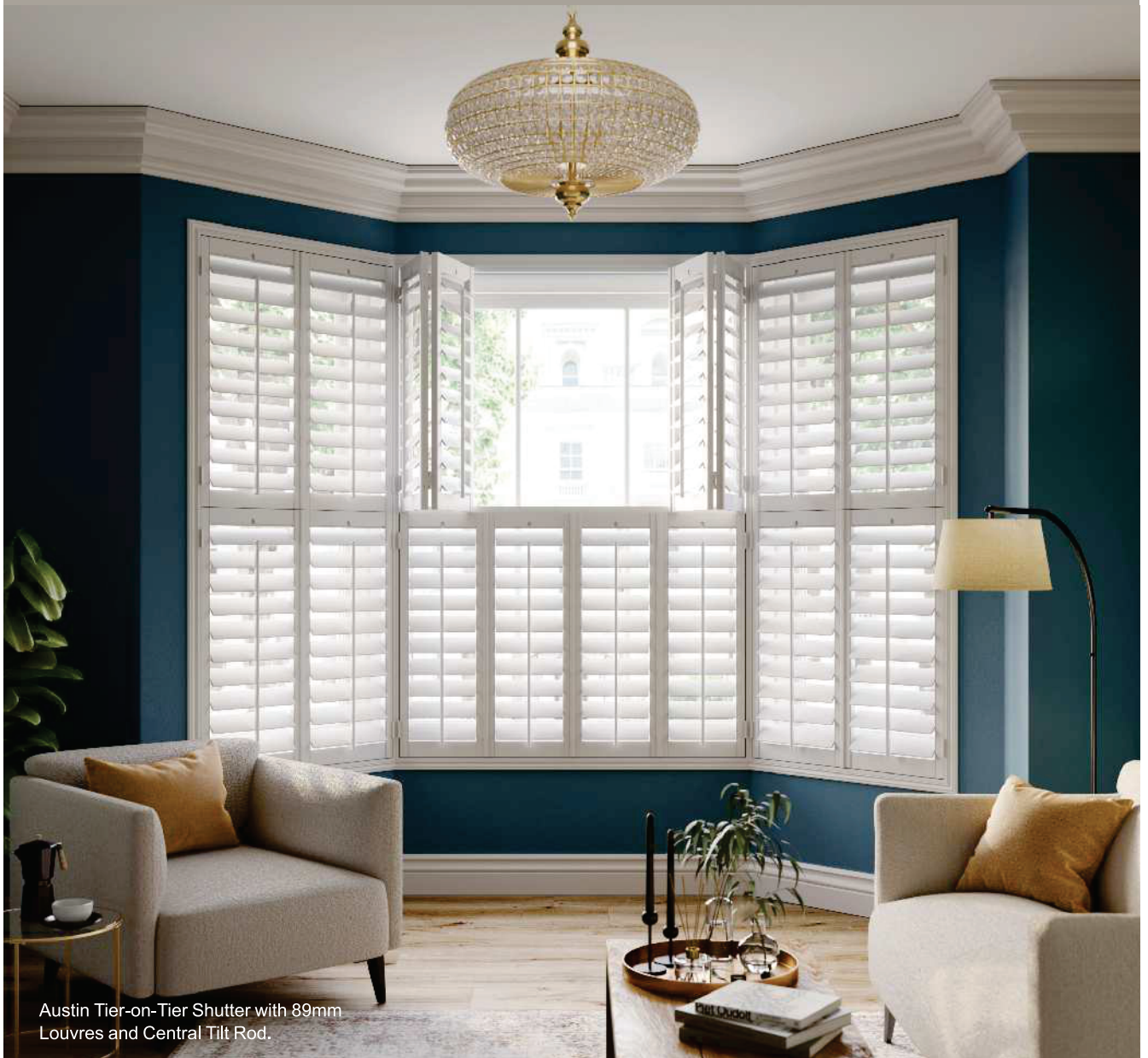
Austin Tier-on-Tier Shutter with 89mm Louvres and Central Tilt Rod.

Tier-on-Tier shutters cover the whole of the window but feature top and bottom panels which open independently of each other. These popular shutters enable versatile control of light and privacy in the daily use of your shutters.