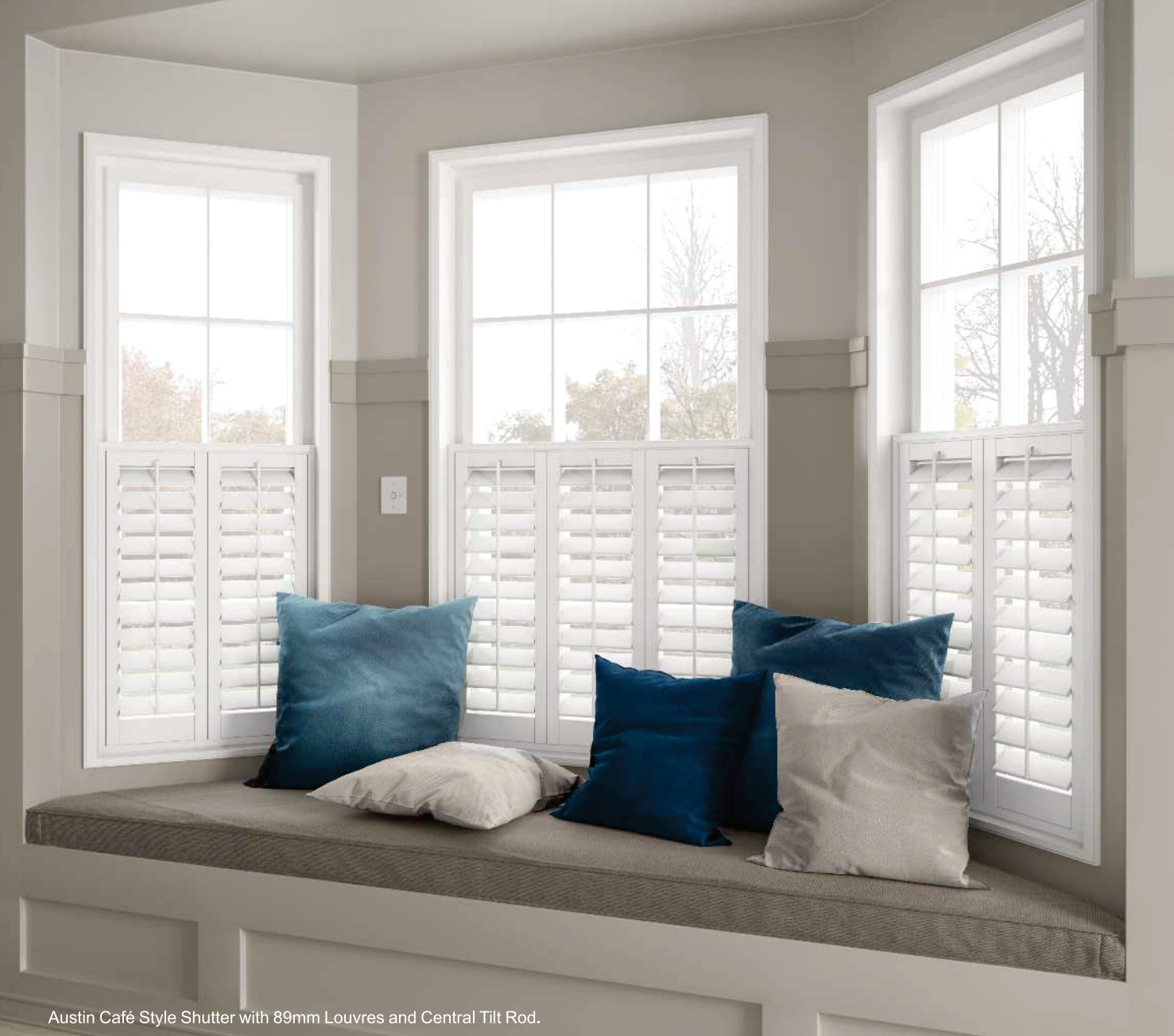
Austin Café Style Shutter with 89mm Louvres and Central Tilt Rod.